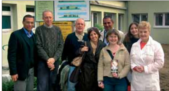
Crescendo in the hospice named after Jan Pawel II, Walbrzych

NGOs pay too little attention to economization of own activities, mostly because of non-for-profit goals – on the one hand, and lack of concern and competences in financial management – on the other hand. Those organizations that managed to prepare and establish administrative and financial resources for funds from EU (which are incredibly huge comparing to previously available funds for NGOs) are now at risk of losing non-profit and social character. They rarely involve vo-