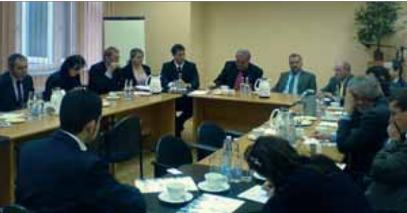
Transnational final event in the Chamber of Commerce of Lower Silesia, Wrocław

The objectives were implemented through: