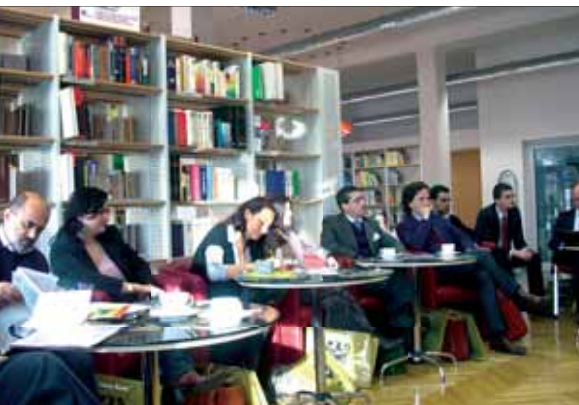
Final event, meeting in the library of Lower Silesia, Wrocław Finalowe przedsięwzięcie w bibliotece Dolnośląskiej, Wrocław

władz regionalnych i jednostek samorządowych z różnych branż – rolnictwa, polityki zatrudnienia, współpracy międzynarodowej, izb handlowych oraz i spółdzielni socjalnych;