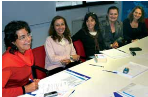
Transnational meeting in Sviluppo Italia Liguria, Genoa