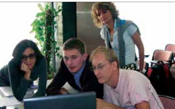
Transnational meeting in the Chamber of Commerce, Sanremo